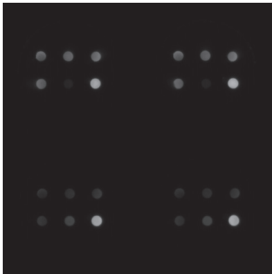
Representative data demonstrating typical sample results and reproducibility (samples are run in duplicates in each row)

The Q-Plex Malaria kit was developed in partnership with PATH.